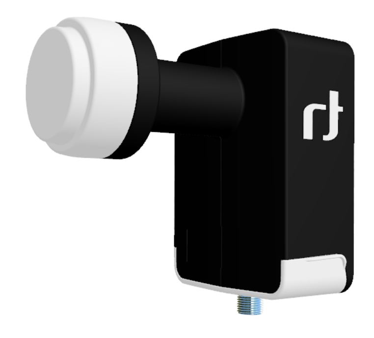
Click object to rotate